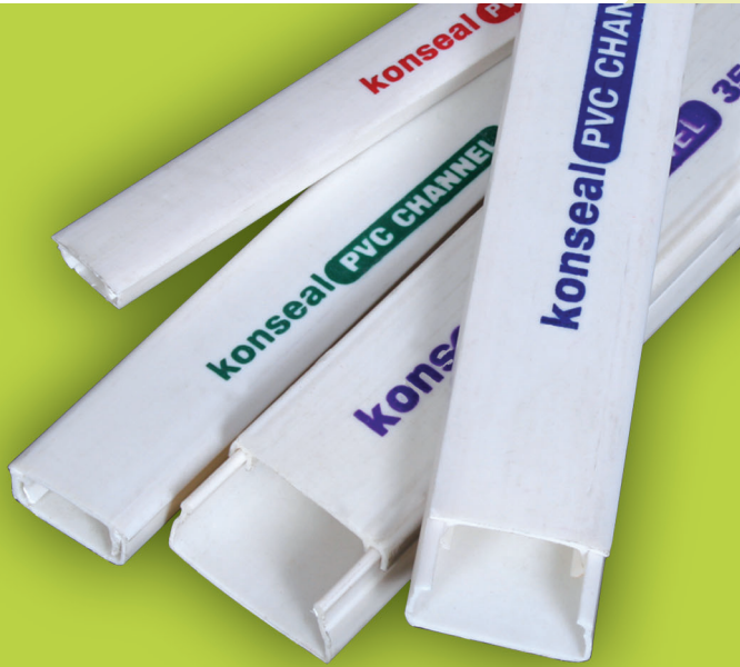
Channels with Double Locking system